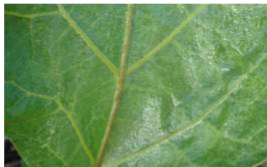
Water Spray with Spreadmax ®