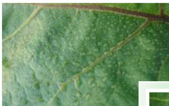
Water Spray without Spreadmax ®

Spreadmax ® is a spray adjuvant that lower the surface tension of a liquid, thereby improves spreading of the liquid (Agrochemical) over the leaf surface.