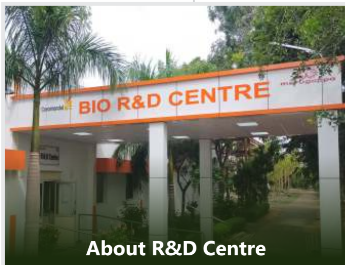
About R&D Centre

Right from its inception in 1992, Bio Products R&D is focussed to meet challenges faced by farmers. Our researchers with inquisitive thinking are dedicated to provide sustainable, innovative and eco-friendly products/solutions for safe and sustainable organic agriculture.